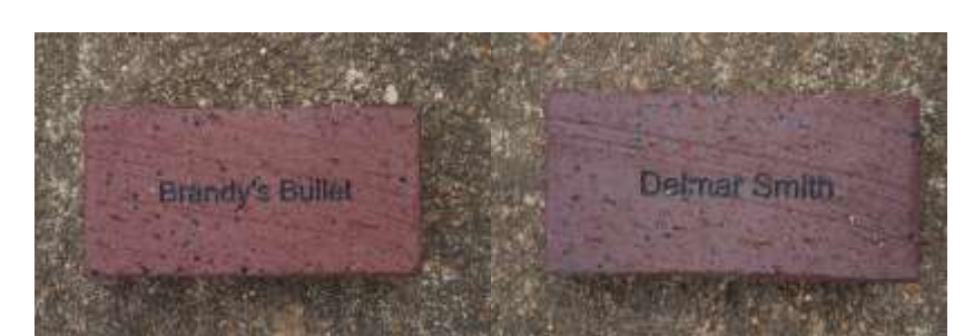
Indicate "Brittany Fund" on your payment.

INTERNET VIA PAYPAL: Log onto the museum's website at <u>www.birddogfoundation.com</u>, click on the Paving Memory Lane brick and enter the required information.