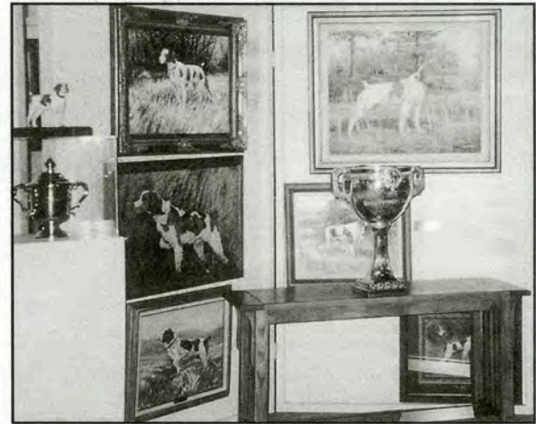
One of the Brittany Panels